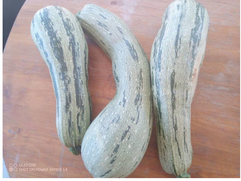
Figure 14: Zucchinis that now supplement the nutritional support program