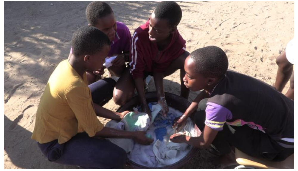
Figure 9: Schools were also provided with laundry detergents to wash clothes and bedding similarly infected Page 6 of 13