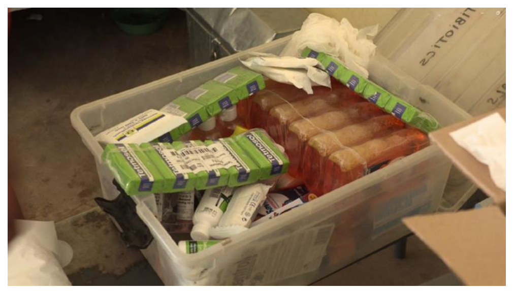
Figure 8: The large quantities of medication purchased to fight the scabies infection

The N/a'an ku sê Lifeline Clinic leapt into action, purchasing the necessary creams and medications to combat the rampant infection.