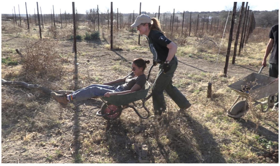
Figure 18: But hours of fun were had too