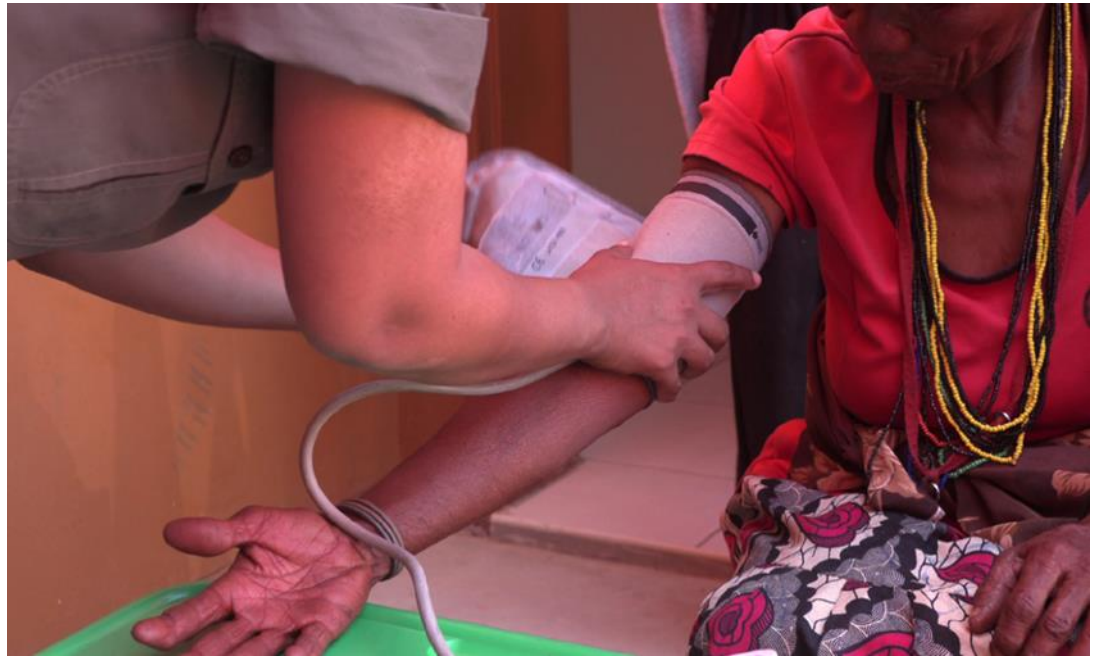
Figure 3: The vitals of every patient are carefully recorded