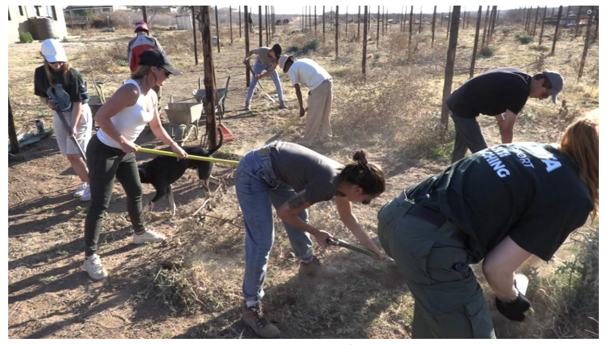
Figure 17: Blood, sweat and tears – the start of the agricultural project in 2021

VAT No.: 4432160-01-5 Reg No.: 21/2007/256 P.O. Box 99292, Windhoek, Namibia. T: +264 (0)81-261 2709 Email: donations@naankuse.com Website: www.naankuse.com