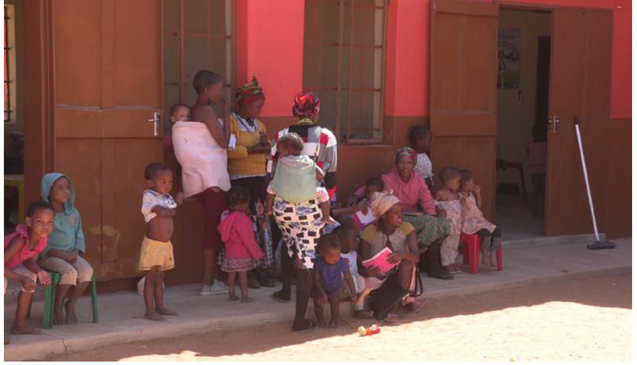
Figure 1: Patients at a remote location line up for an outreach session

A total of 57,142km were driven by the vehicles of the N/a'an ku sê Lifeline Clinic, predominantly the 4x4 ambulance. This irreplaceable vehicle performs emergency transfers to Gobabis State Hospital and the Gobabis Private Health Care facility when necessary and is part of the regular outreach sessions that see the Lifeline Clinic team carry medical treatment to remote locations of the Omaheke Region. Community members in these areas, due to a lack of transport, cannot access the clinic facilities. The outreach sessions are vital to transporting treatment and care far and wide. 2159 patients were treated during outreach sessions in 2022.