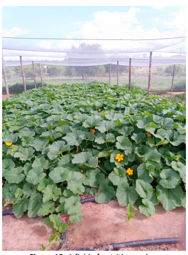
Figure 15: A field of nutritious colour

VAT No.: 4432160-01-5 Reg No.: 21/2007/256 P.O. Box 99292, Windhoek, Namibia. T: +264 (0)81-261 2709 Email: donations@naankuse.com Website: www.naankuse.com