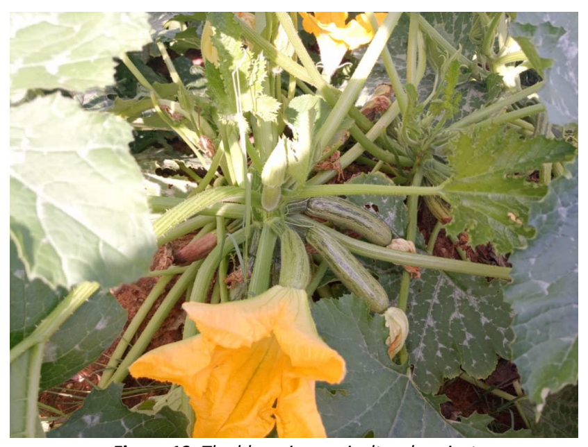
Figure 13: The blooming agricultural project

The bi-weekly nutritional support program is now supplemented by these vitamin-and-mineral-rich items. Up to 120 people receive a nutritious meal per session, 9652 meals served in 2022.