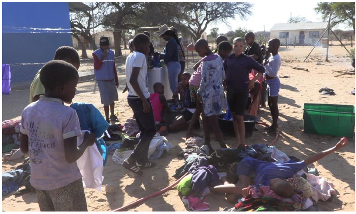
Figure 11: The washing of clothes and bed linen becomes a happy occasion