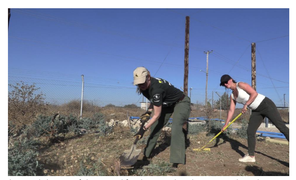
Figure 16: The initial clearing of the ground for the agricultural project – what a long way it has come