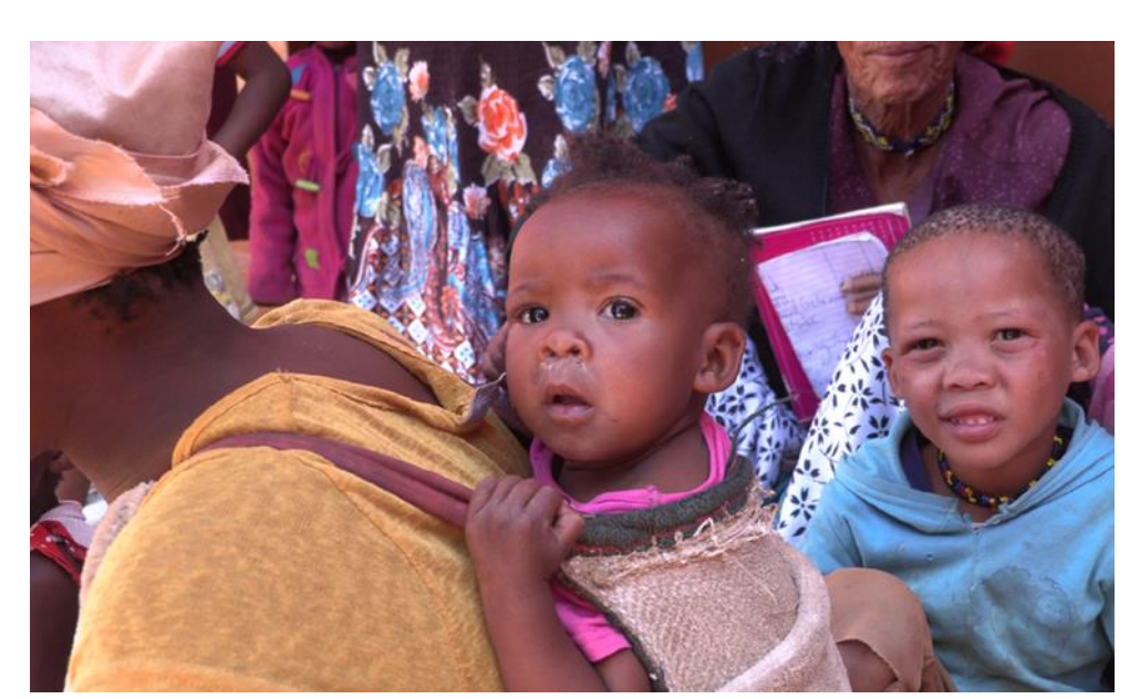
Figure 2: Babies and children are carefully monitored for malnutrition at every outreach session