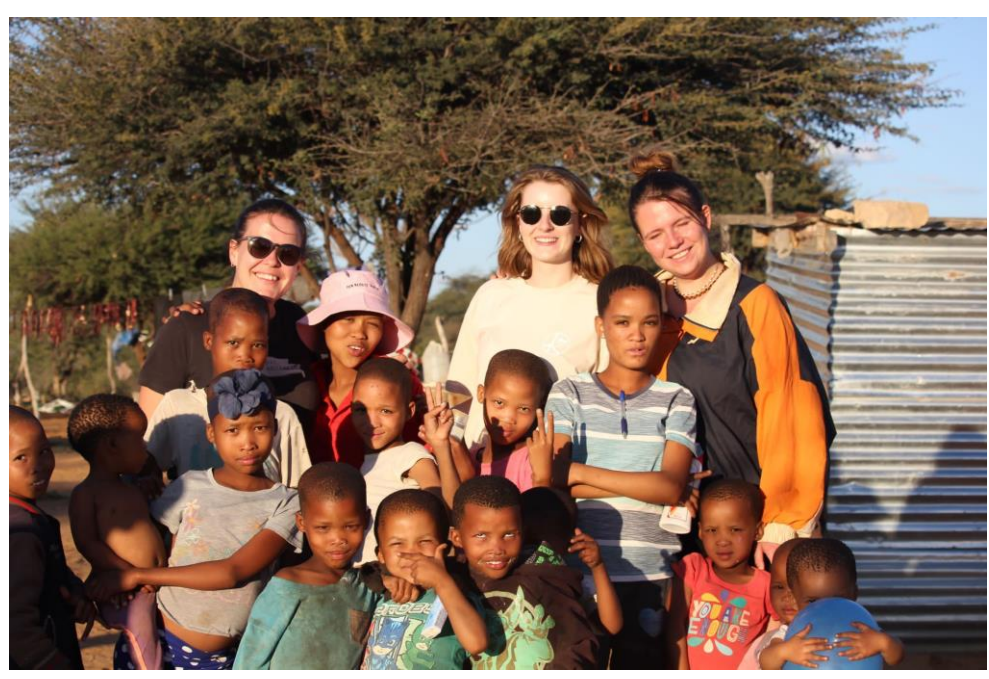
Figure 6: Volunteers meeting the local communities on outreach.

Namibia Charity No.:21/2007/256 | UK Charity No.: 1142421 VAT No.: 4432160-01-5 Reg No.: 21/2007/256 P.O. Box 99292, Windhoek, Namibia. T: +264 (0)81-261 2709 Email: donations@naankuse.com Website: www.naankuse.com