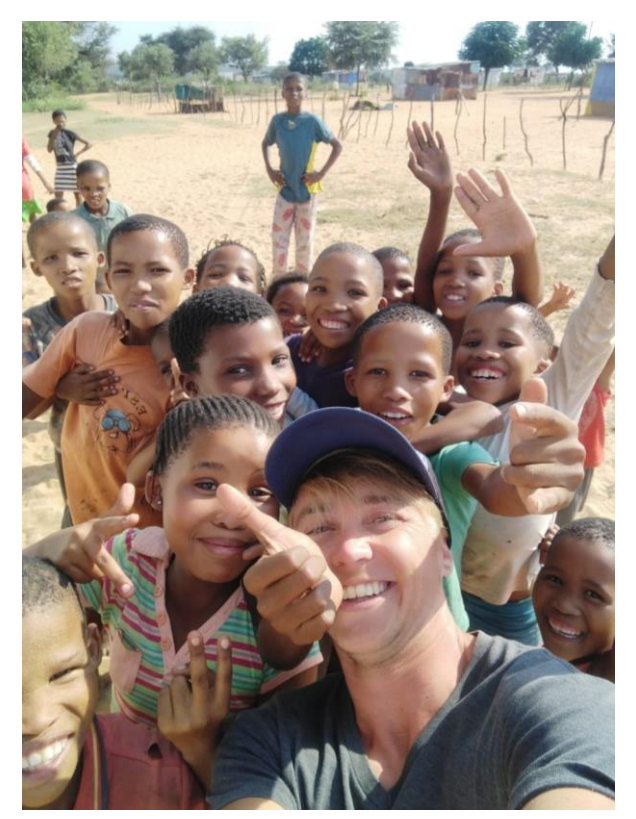
Figure 7: A volunteer causes much delight on an outreach session.