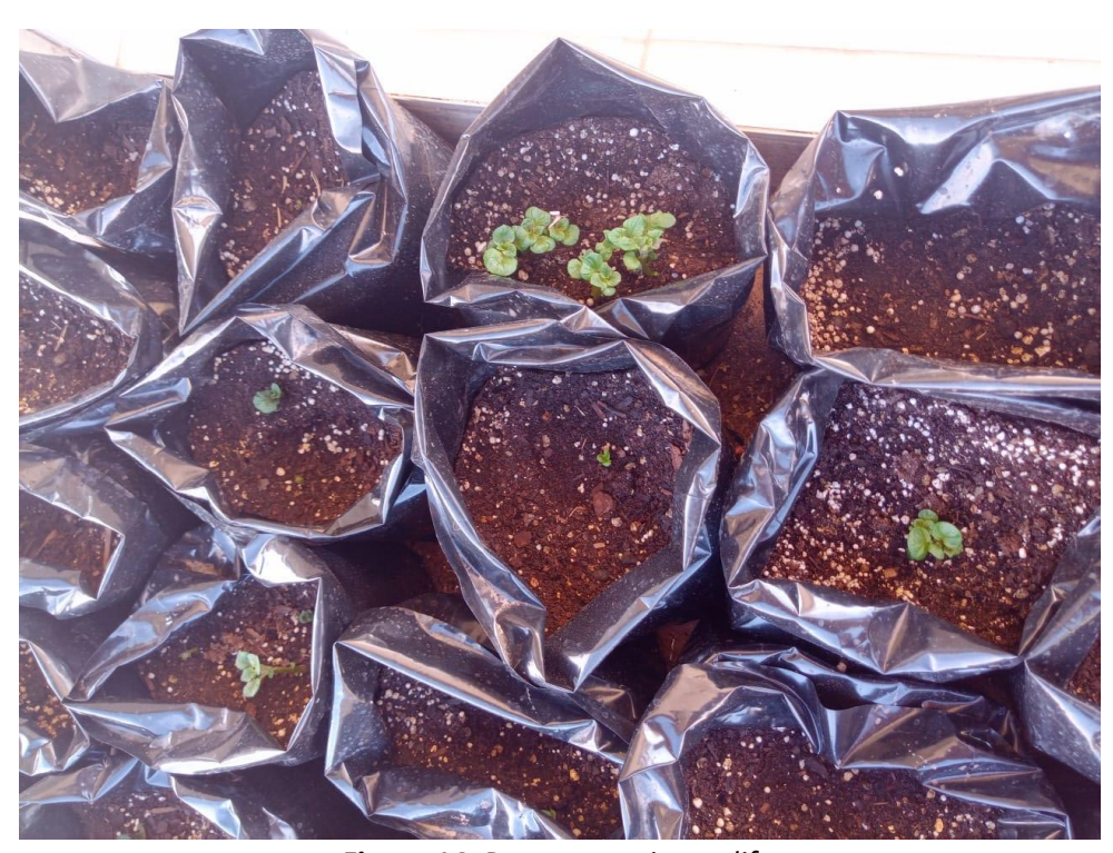
Figure 14: Potatoes spring to life.

P.O. Box 99292, Windhoek, Namibia. 1: +264 (0)81-261 2709 Email: <u>donations@naankuse.com</u> Website: <u>www.naankuse.com</u>