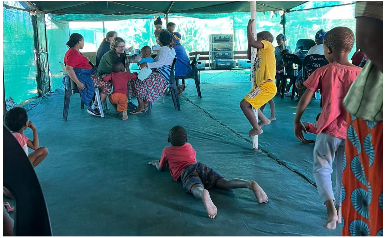
Figure 12: Patient treatment during outreach. The containers housing the medical supplies and medications can be seen in the background.