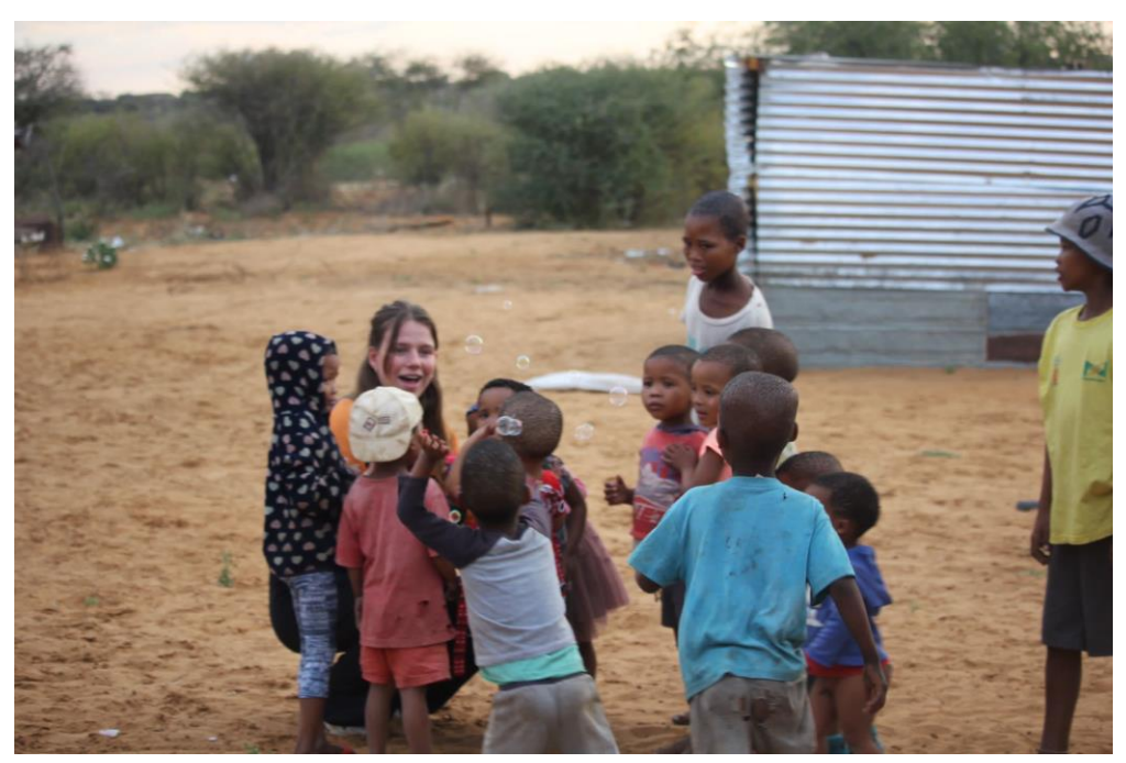
Figure 3: Outreach sessions are also time for fun and laughter.