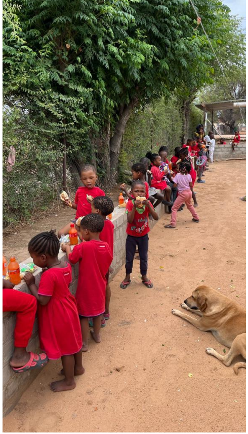
Figure 17: Children attending the Lifeline Clinic School receive daily meals.