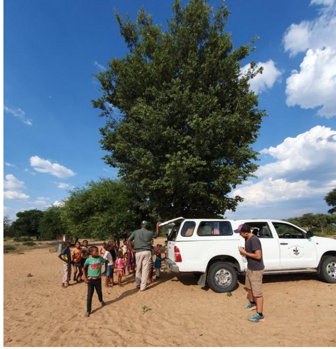
Figure 5 : The Lifeline Clinic vehicle arriving at a remote location for an outreach session.