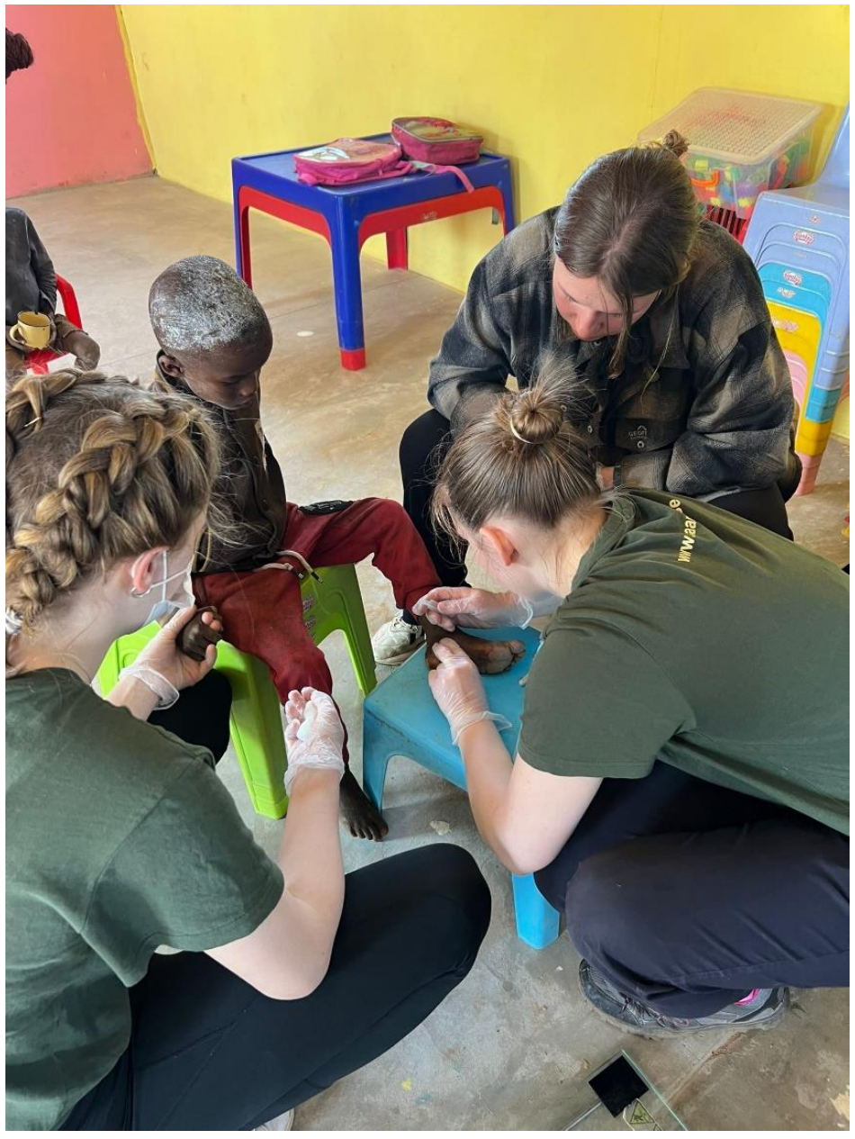
Figure 8: A young boy receives treatment for a fungal scalp infection and a foot injury.

The N/a'an ku sê Lifeline Clinic relies on medicinal supplies on a daily basis. Fungal scalp infections, cuts, bruises, burn wounds and other injuries are tended to almost daily. Antibiotics are administered when necessary and medications dispensed from the Lifeline Clinic pharmacy according to the illnesses and ailments diagnosed.