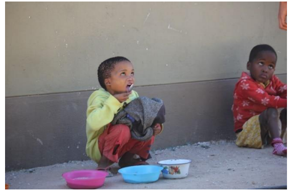
Figure 15: A child digs into a meal during a nutritional support session.

The nutritional support program increases from year to year, nutritious meals feeding the community of Epukiro and surrounds. Over and above the meals provided to the community, additional food items are provided to those suffering from malnutrition. These food items are specifically selected for their high nutritional content and 'fattening' qualities. 11,856 meals were served to the community throughout 2023. This could not have been achieved without the incredible support and generosity of ConTine.