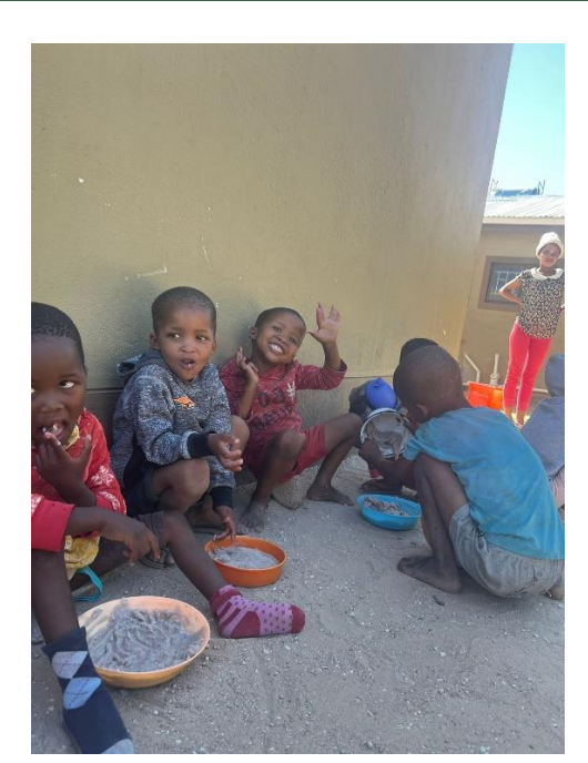
Figure 16: Happy faces tucking into a well-deserved meal. What could be better?

VAT No.: 4432160-01-5 Reg No.: 21/2007/256 P.O. Box 99292, Windhoek, Namibia. T: +264 (0)81-261 2709 Email: donations@naankuse.com Website: www.naankuse.com