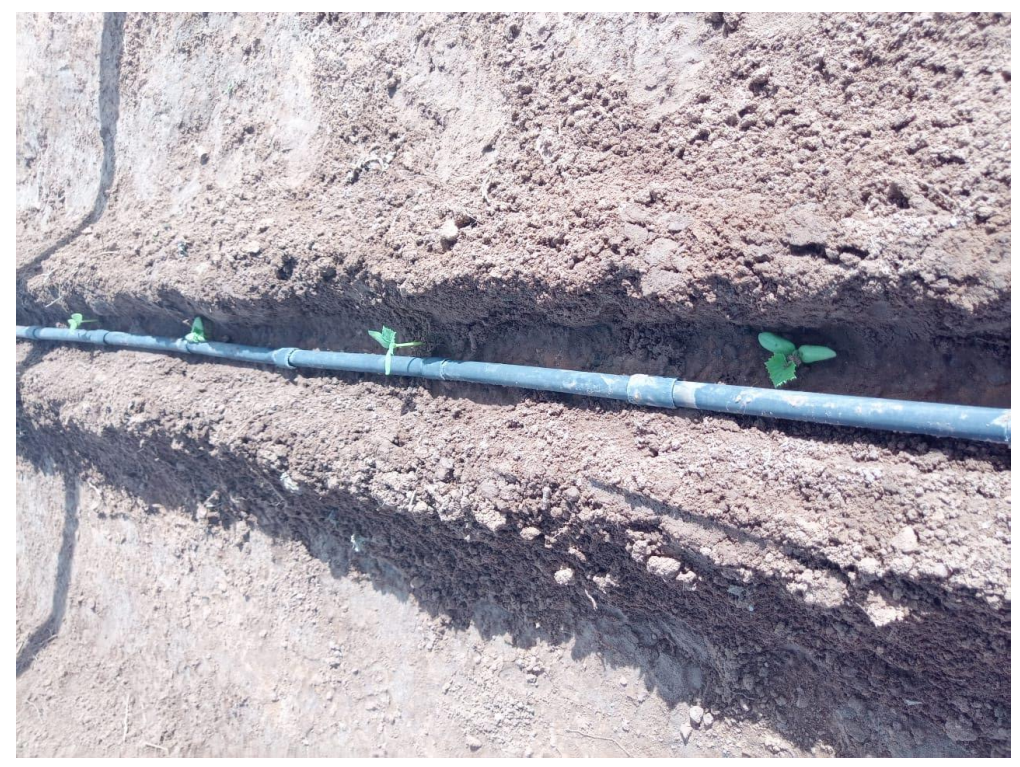
Figure 13: Cucumber seedlings start sprouting.