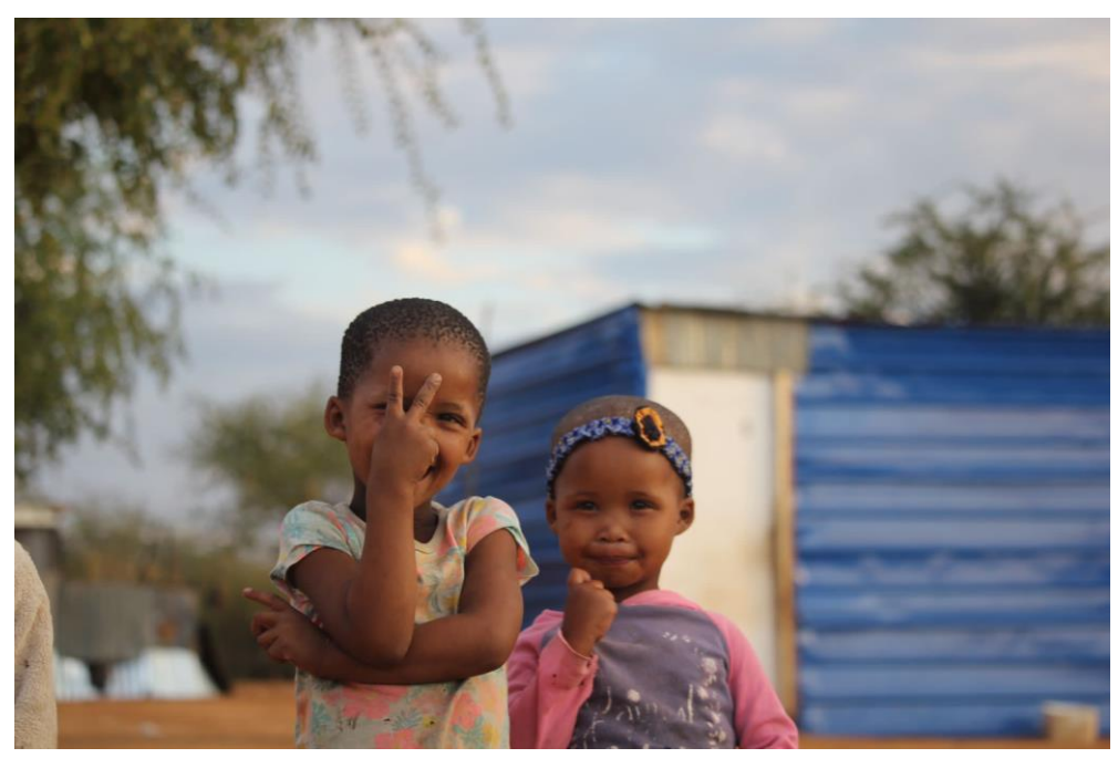
Figure 2: Children as seen on an outreach session.

Namibia Charity No.:21/2007/256 | UK Charity No.: 1142421 VAT No.: 4432160-01-5 Reg No.: 21/2007/256 P.O. Box 99292, Windhoek, Namibia. T: +264 (0)81-261 2709 Email: donations@naankuse.com Website: www.naankuse.com