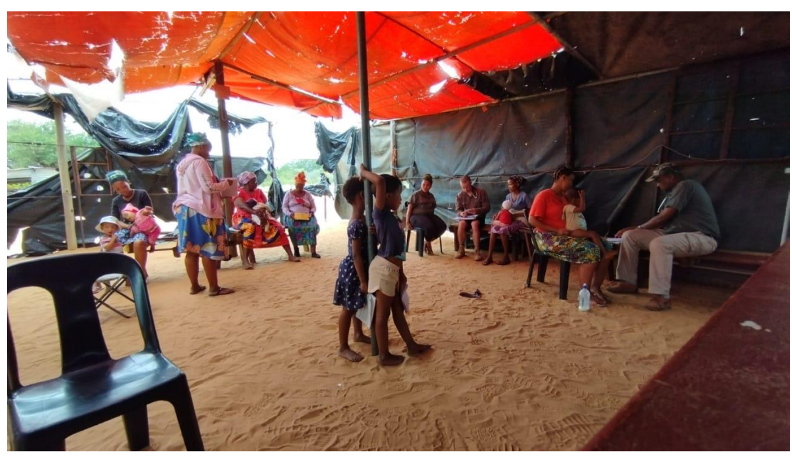
Figure 4: Nurse Theo treating patients on an outreach session.

VAT No.: 4432160-01-5 Reg No.: 21/2007/256 P.O. Box 99292, Windhoek, Namibia. T: +264 (0)81-261 2709 Email: donations@naankuse.com Website: www.naankuse.com