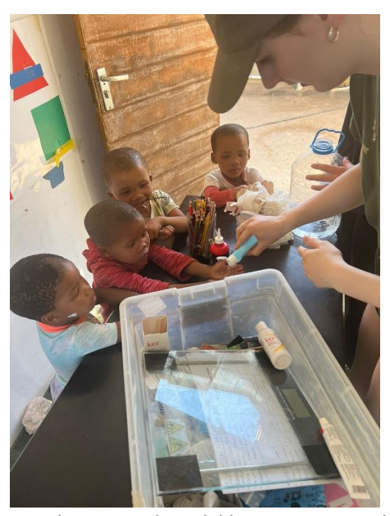
Figure 10: A volunteer tends to children on an outreach session.