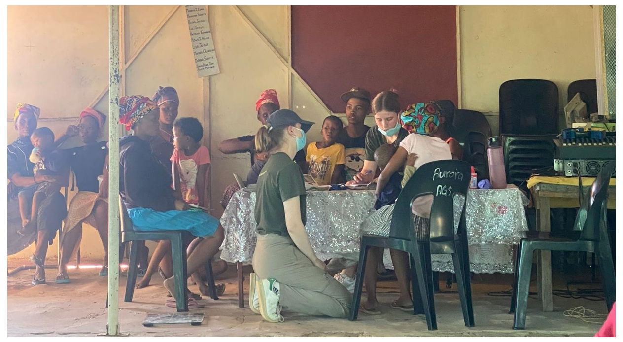
Figure 11: The team performing preliminary health checks during an outreach session.

Namibia Charity No.:21/2007/256 | UK Charity No.: 1142421 VAT No.: 4432160-01-5 Reg No.: 21/2007/256 P.O. Box 99292, Windhoek, Namibia. T: +264 (0)81-261 2709 Email: donations@naankuse.com Website: www.naankuse.com