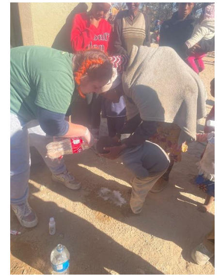
Figure 1: A child receives treatment for a fungal scalp infection during an outreach session.

A total of 40,520 kilometres were driven by the Lifeline Clinic team for the duration of 2023. Mileage making up this colossal number includes outreach sessions to remote communities up to 200km away. Not all community members are able to access the clinic itself, living in remote locations and lacking transport. The Lifeline Clinic team performed 52 outreach sessions in 2023, treating a total of 2,256 patients during these vital outreach projects. Mileage also includes emergency transfers, when necessary, from Epukiro to both private and state hospital facilities in the town of Gobabis.