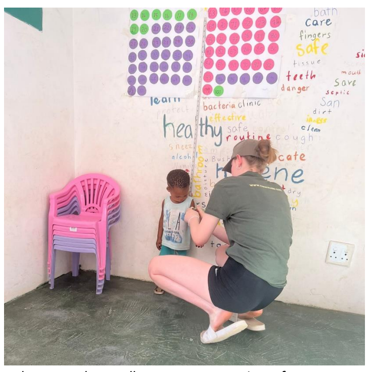
Figure 9: A child is weighed and measured, as well as an upper arm circumference test performed. This is to ascertain if malnutrition is affecting the child. In instances of observed malnutrition, necessary supplements are given.

Namibia Charity No.:21/2007/256 | UK Charity No.: 1142421 VAT No.: 4432160-01-5 Reg No.: 21/2007/256 P.O. Box 99292, Windhoek, Namibia. T: +264 (0)81-261 2709 Email: donations@naankuse.com Website: www.naankuse.com