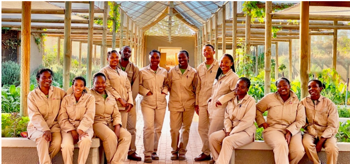
HORTICULTURE CLASS OF 2023 | LEVEL 3 | WOLWEDANS DESERT ACADEMY | HARDAP REGION | NAMIBIA