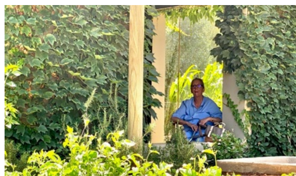
Day to day scenes from the garden. Can one imagine this lush green space in the middle of the Namib desert? The AridEden Project Logo carried proudly on the back of trainee overalls. Top: Composing boxes are used to farm earthworms. Trainees attending to the healthy plants. Bottom right: A visitor from Maltahöhe enjoying a moment of peace and tranquility.