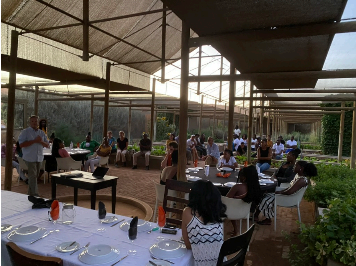
Official celebration during the speech of stephan brückner (founder of the wolwedans foundation)