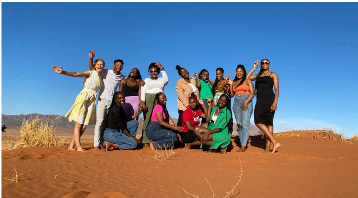
Group of graduates in the NamibRand Nature Reserve 04. November 2024